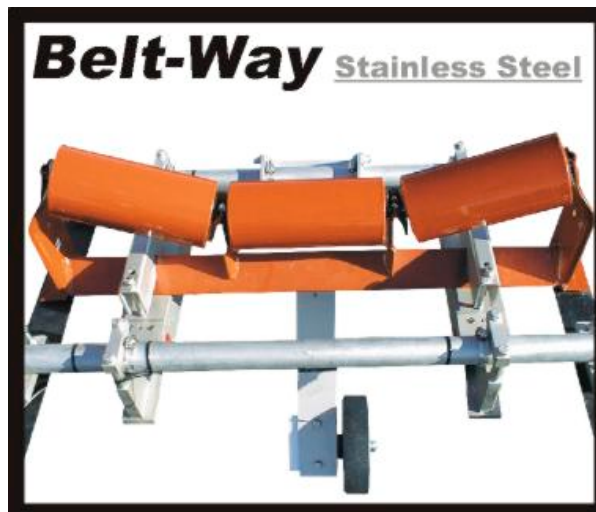
Low, Medium, and High Capacity Models Available