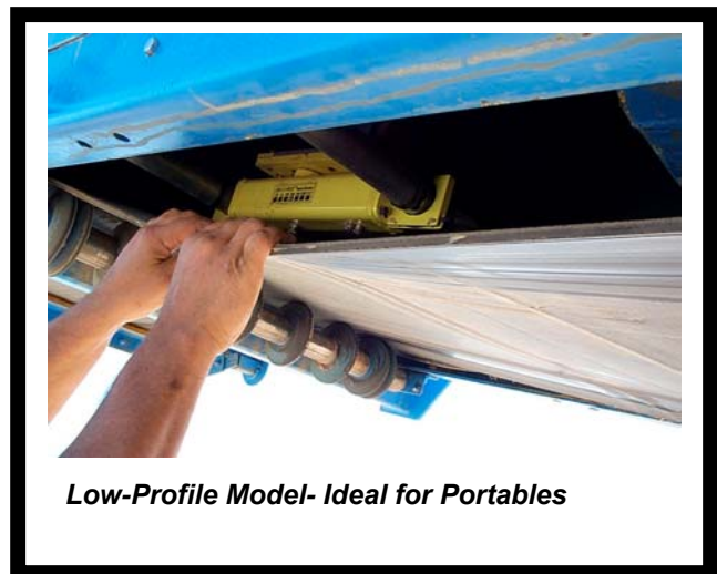
Low-Profile Model- Ideal for Portables